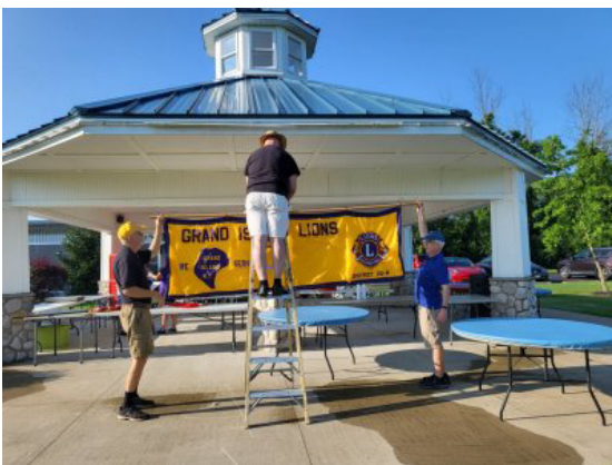
Some pictures from our Lions Kids Special Picnic 2023